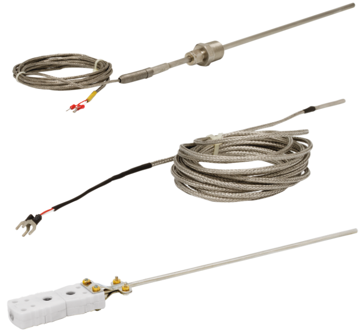
TRANSITION JOINT RTD WITHOUT HEAD

Liquid & gaseous mediums Power & Utilities Water treatment plants Furnace, Ovens & Boilers Machineries, Plants & Tanks Autoclaves / Pharmaceuticals Bearing temperature / Turbines