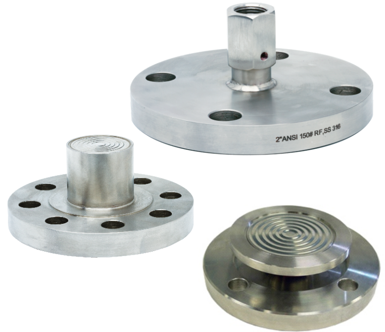
FLANGED SEAL FLUSHED DIAPHRAGM

Separation systems Isolation applications Viscous & corrosive media High-pressure applications High vibration application